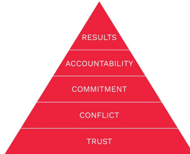
The Five Behaviors® Model